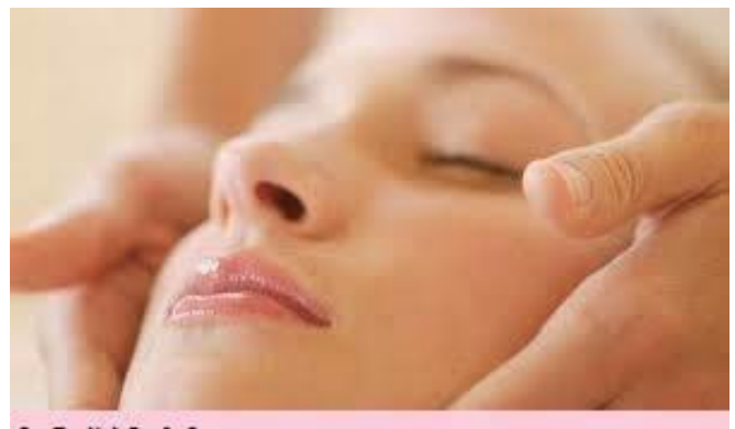
Is Reiki Safe?

Reiki is unique among energy medicine techniques because the practitioner is connected with this source or universal or spiritual energy through an attunement process during class - much like fine tuning the dial on your radio. As the practitioner is "tuned in", their energy system is shifted to allow this universal, God-consciousness energy to flow through them. This makes Reiki easy to learn and practice. To share Reiki it only takes your intention to start the flow of Reiki after receiving an attunement in class. The flow of this subtle, healing energy is enhanced with practice and self Reiki. For me, Reiki feels like there is this gracious liquid love and light flowing as I work with the energy. Reiki always focuses on bringing about shifts that are for the highest good of the person receiving it.